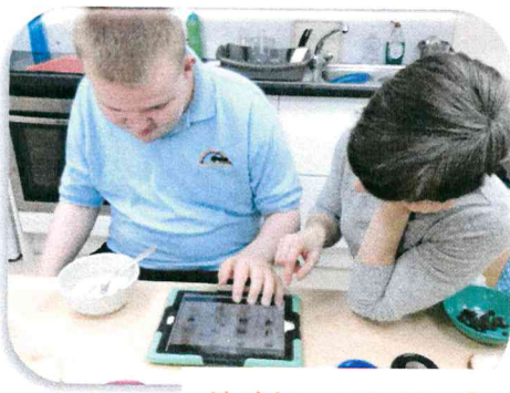
Making our snack choices.