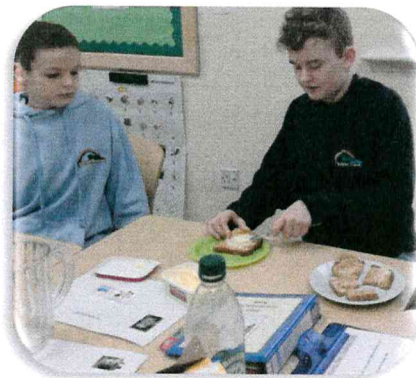
Pouring juice and spreading the toast.