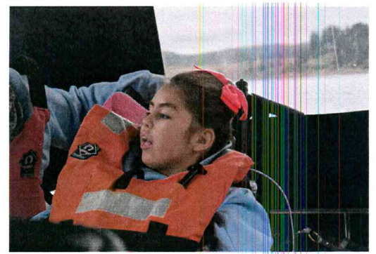
Some of the children have been enjoying the thrill of being out on a boat.