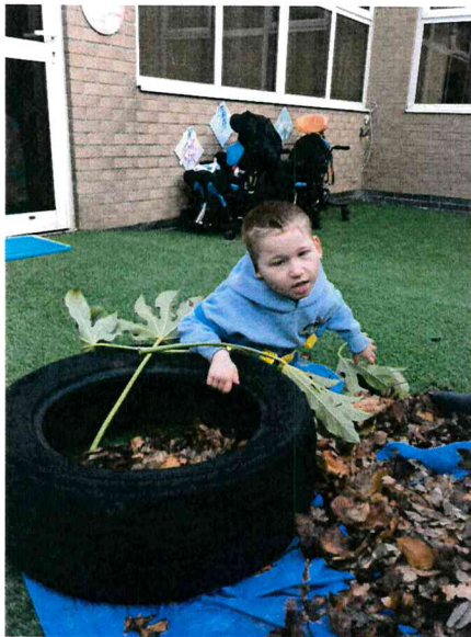
Maple/Willow have been enjoying 'Outdoor Learning' in the garden.

With waterproof clothes on the children have been out exploring in the rain and have had great fun playing in the last of the Autumn Leaves.