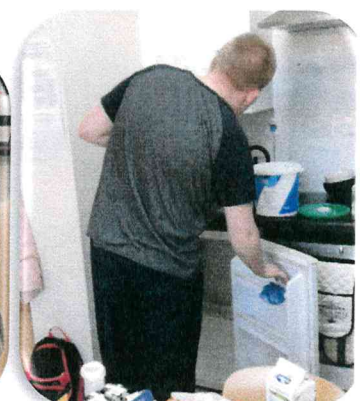
The fridge cleaning team in action!