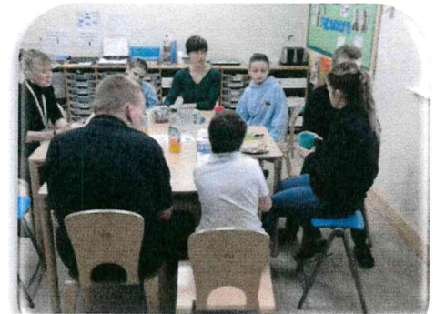
Being sociable, friends together.