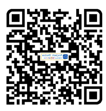
Scan QR code with your phone camera to link to website.

Project Choice Supported Internship College The Grainger Suite, Dobson House, Regent Centre, Newcastle upon Tyne, NE3 3PF